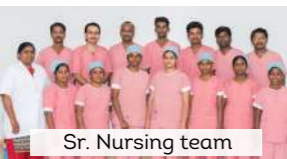
Sr. Nursing team