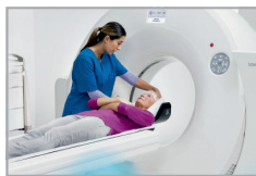
MULTI SLICE CT