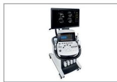
4D/5D ULTRA SOUND