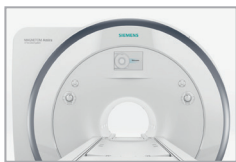
NEXT GENERATION 1.5 TESLA MRI