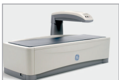
BONE MINERAL DENSITOMETER